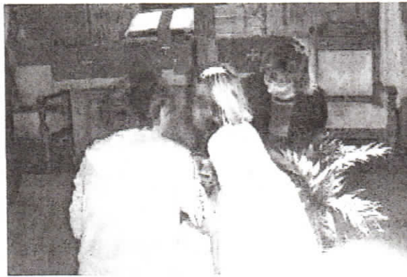
Sunday School children open the Palm Sunday service by waving palms and placing flowers on the cross. April 13th