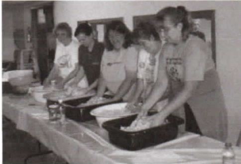
(Left) Prepping the night before.