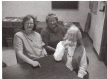
(Below) Kitchen helpers.