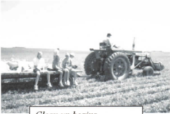
Clean up begins