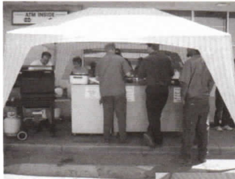
EconoFoods Brat Stand June 19-21, 2003