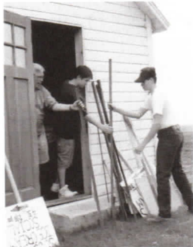
About 25 adults and children came to help with the cleanup project.