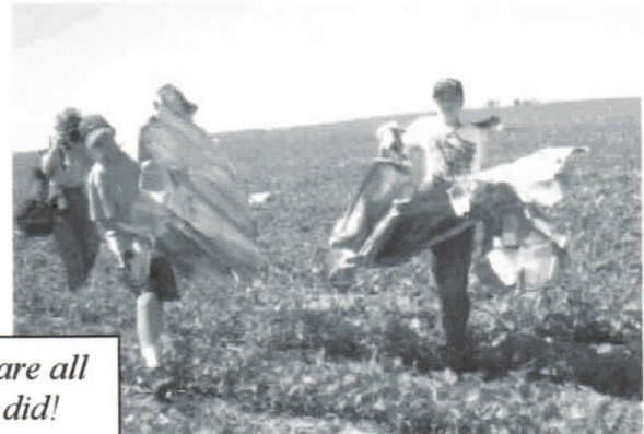
Great job done! We are all very proud of all you did!