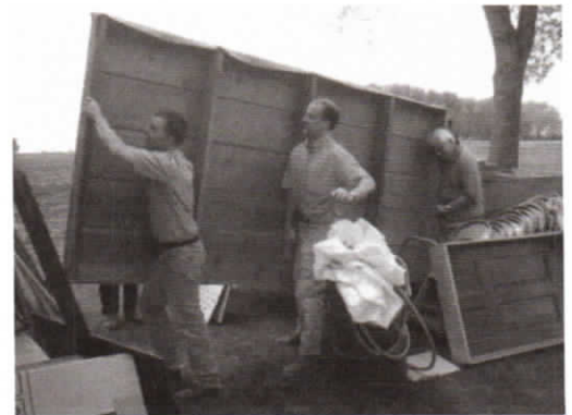
Gosh, that looks heavy....