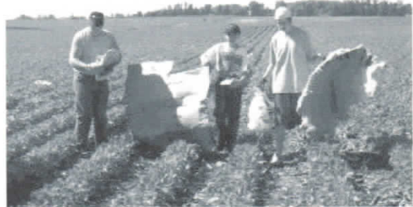
Walking through fields