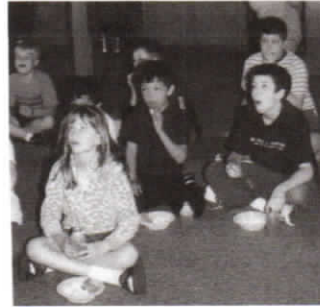
Some outdoor fun and a Veggie Tale video.