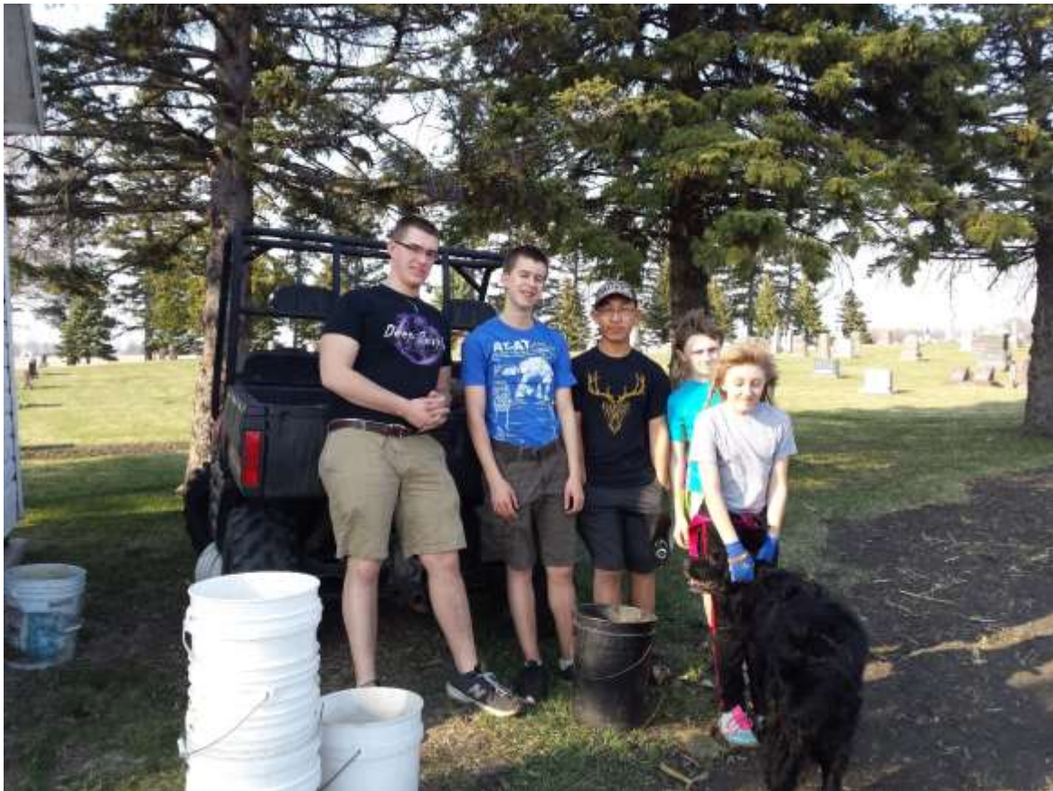
Rock picking - getting ready to plant the new grass.