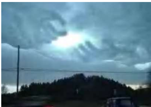
Photo taken in Alabama ~ We have a God, and he's watching over us. Would you look at this picture? It reminds me of that song 'He's got the whole world in his hands.' He is definitely in control!