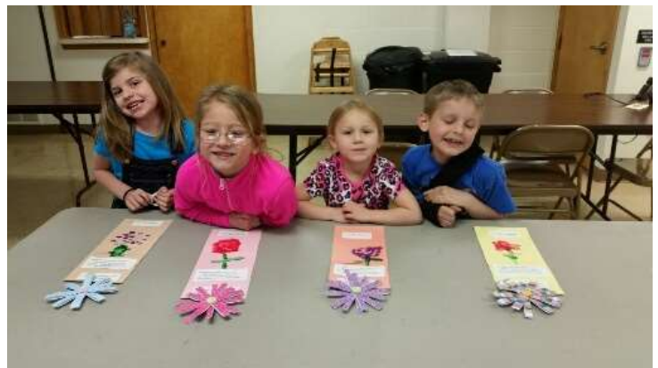
Making Mother's Day gifts