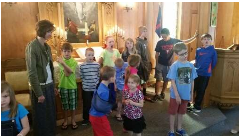
Practice makes perfect!

We figured out that God meant all of it for good and remained faithful. God is always with us - especially when we are going through a tough time!