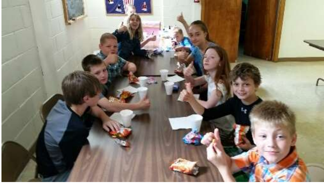
Younger members of the Sunday School!