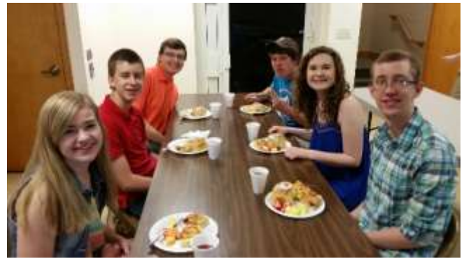
“Older” youth of the church!